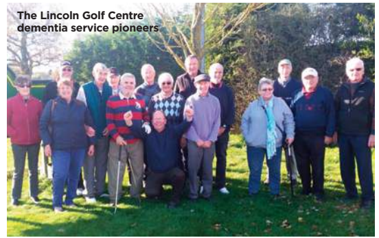
The Lincoln Golf Centre dementia service pioneers